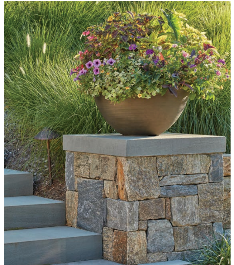
Clockwise from opposite, top: An elegant stone wall with a custom mahogany gate is bolstered by crape Myrtle, providing separation between the driveway and outdoor living space. A serene, rectangular pool framed at one end with boxwood, hydrangea and Sweet Bay magnolia boasts a solar shelf for sunbathing. A planter situated atop a refined stone pier highlights Walnut Hill's attention to detail and craftsmanship. Copper scuppers recessed into a stone wall create tranquil sound as water spills into the pool below. Drift roses, nepeta and boxwood surround a timeless water feature.